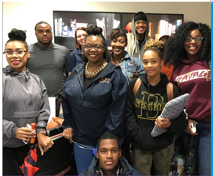
New potential mentors from VSU