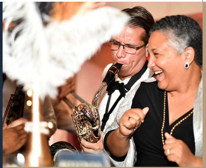
Check out more roaring great photos on our Facebook page @BeaBigVA

An Evening for Kids' Sake, presented by Altria, was held at the Hippodrome and raised $140,000 to support 100 new matches for Big Brothers Big Sisters!